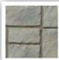
Castle Rock Limestone