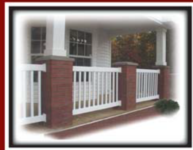
Brick Column Sleeve™