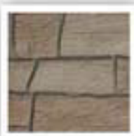
Ledgestone Beige Blend