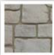
Cobblestone Marble Gray