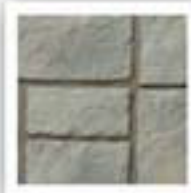
Castle Rock Marble Gray