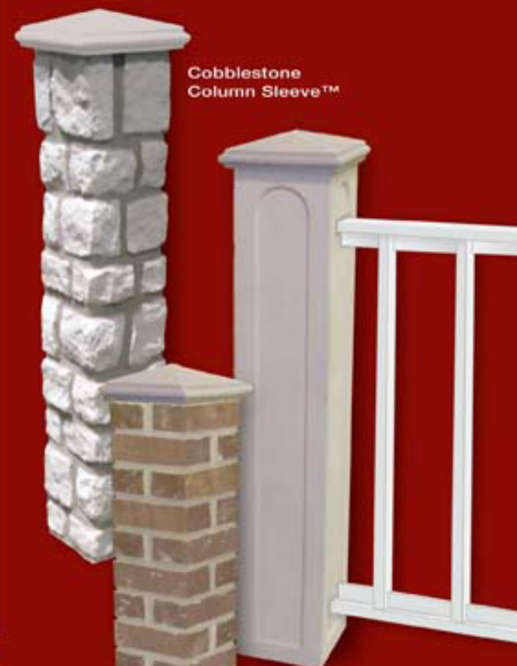
Cobblestone Column Sleeve™