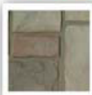
Castle Rock Summer Tan