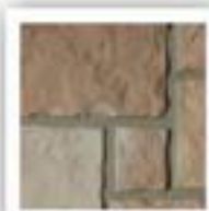
Castle Rock Sierra Sand