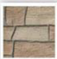
Ledgestone Summer Tan