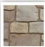
Cobblestone Summer Tan