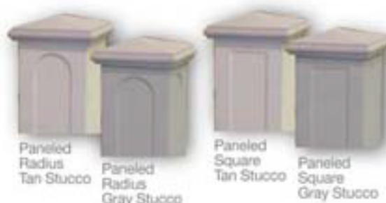
Paneled Radius Tan Stucco