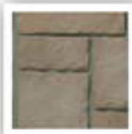
Castle Rock Beige Blend