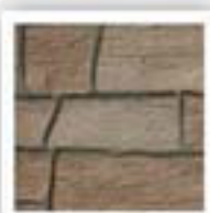
Ledgestone Sierra Sand