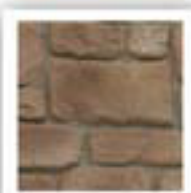
Cobblestone Sierra Sand