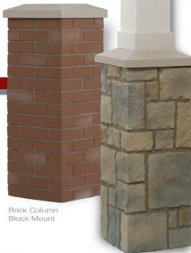
Brick Column Block Mount