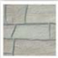
Ledgestone Marble Gray