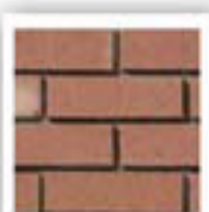
Brick Bold Rouge Dusted